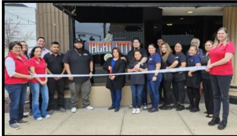
El Jacalito 14 E. 3rd St., Sterling 815-625-3404