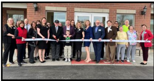
Heritage Woods of Sterling 15 year anniversary 2205 Oak Grove Ave, Sterling 815-625-7054