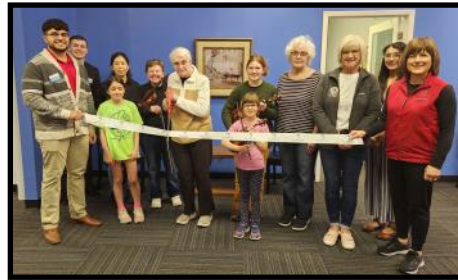
Viva Performing Arts 113 E 1st St., Dixon 815-285-4924