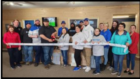
Sterling Fence & Deck 2704 N. Locust St., Sterling 815-625-2201