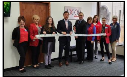
Axiom Wealth Advisors 101 E 1st St., Dixon 815-284-9877