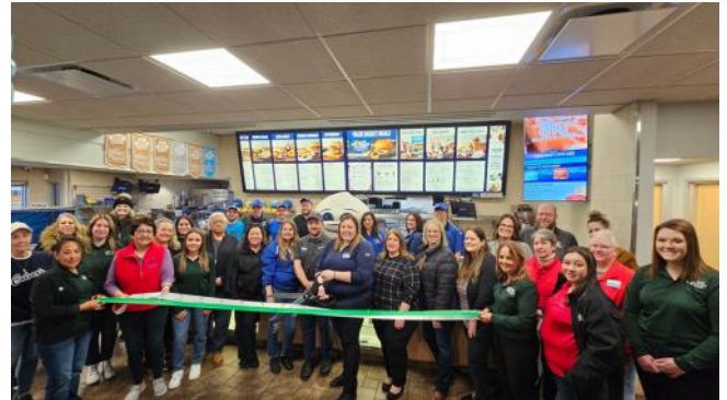
Culver's of Rock Falls —Grand reopening! 1901 Harley Davidson Dr., Rock Falls 815-535-9401