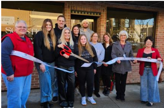
Solstice Salon & Scalp Spa 17 E. 3rd St., Sterling 309-752-3218