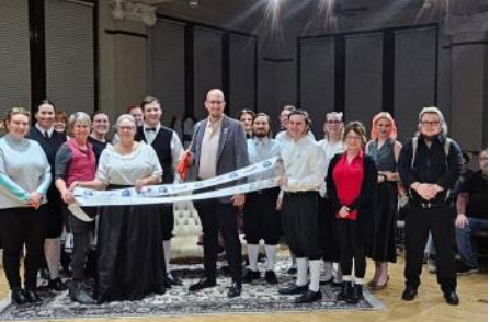
Mosaic Theatre Troupe Check out their facebook page for more information!