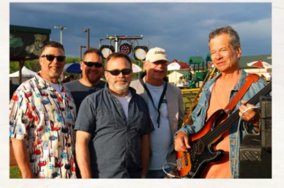
Additional sponsorship provide by: Micron Industries • CGH Medical Center Boss Roofing-Siding Experts Majeski Motors • TBK Bank Showplace Antiques & Treasures